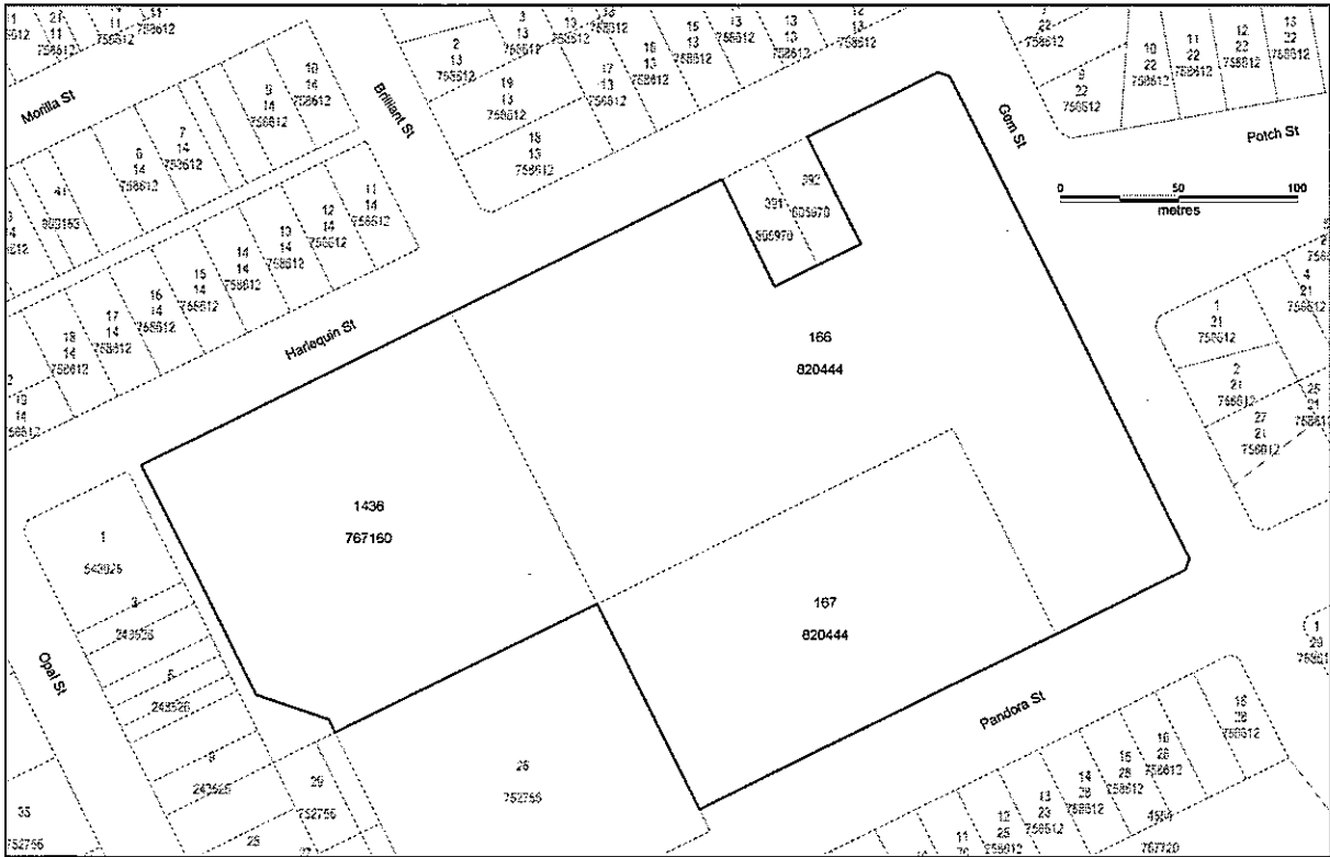
Figure – Existing lots.