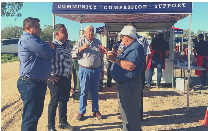
Walgett Shire Councillors meet with Deputy Premier John Barilaro