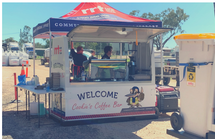
Rapid Relief Team provide Free Coffee & BBQ