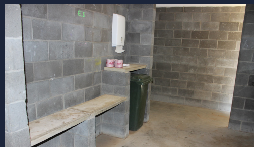
Photos of the finished toilets and a before shot.

In 2021, Council secured grant funding under the Crown Lands 2020-21 Crown Reserves Improvement Fund (CRIF) program for the refurbishment of the Female amenity block located at the Walgett Showgrounds. The amenity block has been transformed into a modern amenity, providing a renewed space for the community and recreational activities. Despite the challenges brought on by the restrictions in 2021, the project was able to be completed in November 2021.