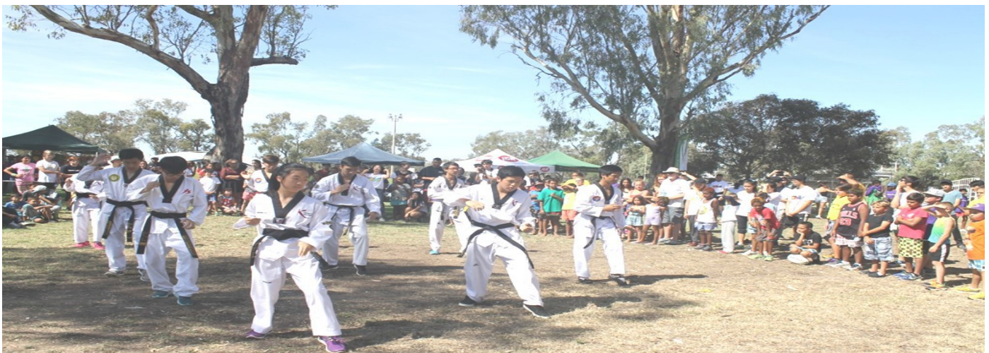
Participants across the Shire engage in Tare Kwon Do lessons as part of Youth Week Activities

In 2014/15 Council supported local organisations in securing funding for infrastructure projects relating to sports and physical exercise options for its residents. Maintenance and programs developed around outdoor gym equipment in three (3) communities, Walgett, Lightning Ridge and Collarenebri, support efforts of services and implementation of sustainable health programs.