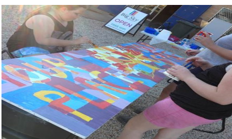
Bottom Left and Right : Lightning Ridge youth design and paint new signage for the Lightning Ridge Library