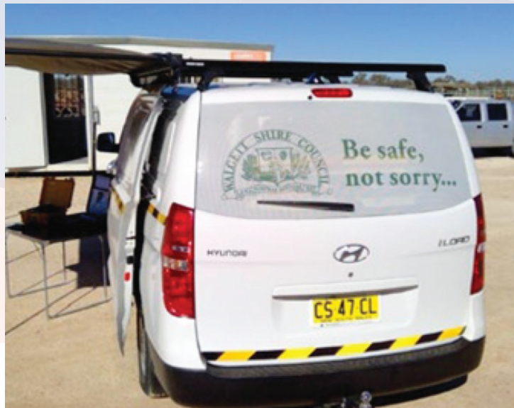
Walgett Council has taken workplace health and safety into the field.

The award for excellence, which recognises outstanding achievements for risk management innovation, was an outstanding achievement showcasing Council's on-going commitment to raising the bar on organisational risk management compliance, and it once again showed the professionalism and dedication of staff toward the development of a continuous improvement environment. The project also received a commendation in the Statewide Mutual Risk Management Excellence Awards for 2020.