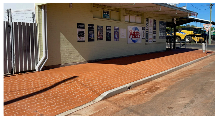
New footpath work in Euroka Street Walgett.