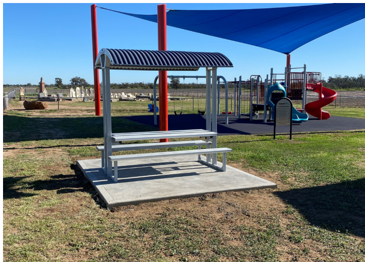
New Playground equipment and seating.